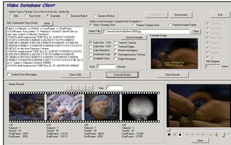
Figure 2. VDBMS query interface.

visual feature descriptors [12,15], camera motion classification [38], spatial and temporal segmentation [14,16], and the semantic annotations of domain experts. The video, its features and indices are stored in the VDBMS database, along with physical metadata such as resolution for quality-of-service presentation. Our system follows the recent trend of representing the video content description in an XML-like format according to the MPEG7 [23] worldwide standard for multimedia content descriptors. MPEG7 standards are an integral part of VDBMS feature representation, and our video processing extracts nearly all low-level features defined as standard, including color histogram in both HSV and YUV formats, texture tamura, texture edges, color moment and layout, motion and edge histograms, dominant and scalable color, and homogeneous texture.