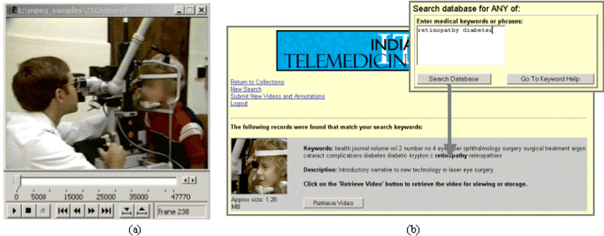
Figure 3. (a) Content-based access control for streaming video: the face of the patient is blurred during streaming, since the end-user is not authorized to view this object. (b) User interface to the medical video library: index, store, access, query, retrieve, stream.

Video elements are specified either explicitly by identifiers or implicitly by their semantic content. Our framework for semantic content analysis is general, and supports either semantic or visual feature descriptors for content. The implicit content identification of video elements applies “concepts” (such as keywords from the video annotations, faces from a catalog, etc) to specify semantic information about the actual content of a set of video data objects. The concepts determine how to restrict access to videos dealing with the specified content. Our control algorithm determines the authorized portions of a video that a user may receive, given the user credentials and the video content description [8,10].